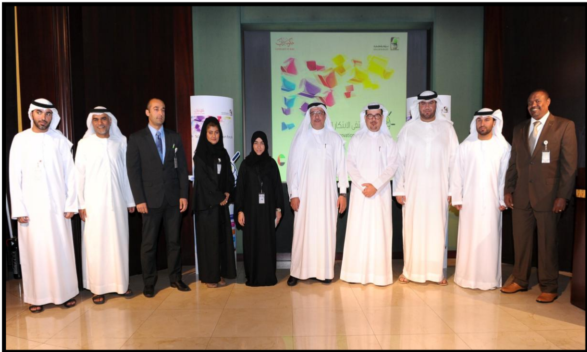
Figure (15): The team work of the initiative/experience from Dubai Municipality (27/04/2016)