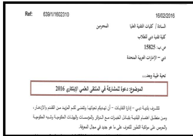
Figure (4): Examples of invitation letters sent to the targeted groups (16/02/2016)