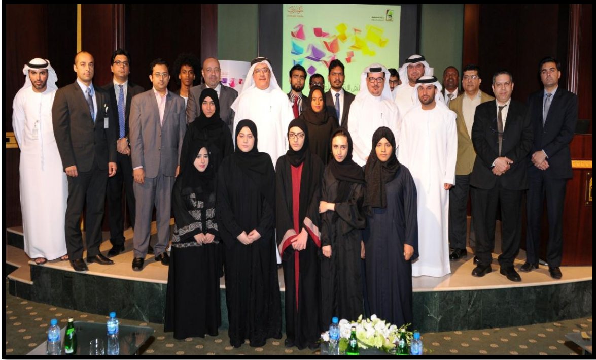
Figure (14): Group photo with representatives of educational institutions of professors and students participating in the forum/initiative (27/04/2016)