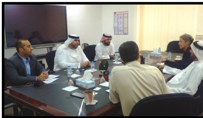
Figure (6): Meetings hold with the British and American Universities to discuss the initiative (03/04/2016)