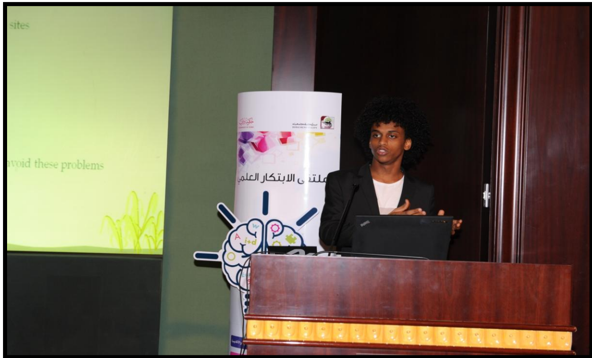
Figure (12): The presented paper by American University in the Emirates (27/04/2016)