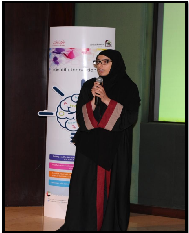
Figure (9): The presented paper by Zayed University (27/04/2016)