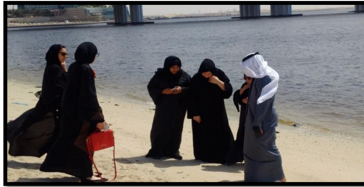
Figure (5): A field visit by Zayed University's students to the Water Canals and Creeks Unit for the operational mechanism of action for cleaning of water canals (26/03/2016)