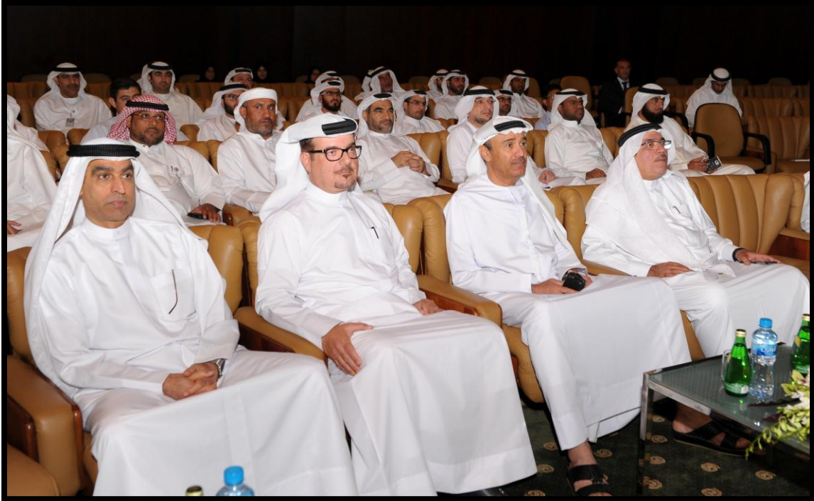
Figure (7): The top-management of Dubai Municipality at the First Scientific Innovation Forum (27/04/2016)