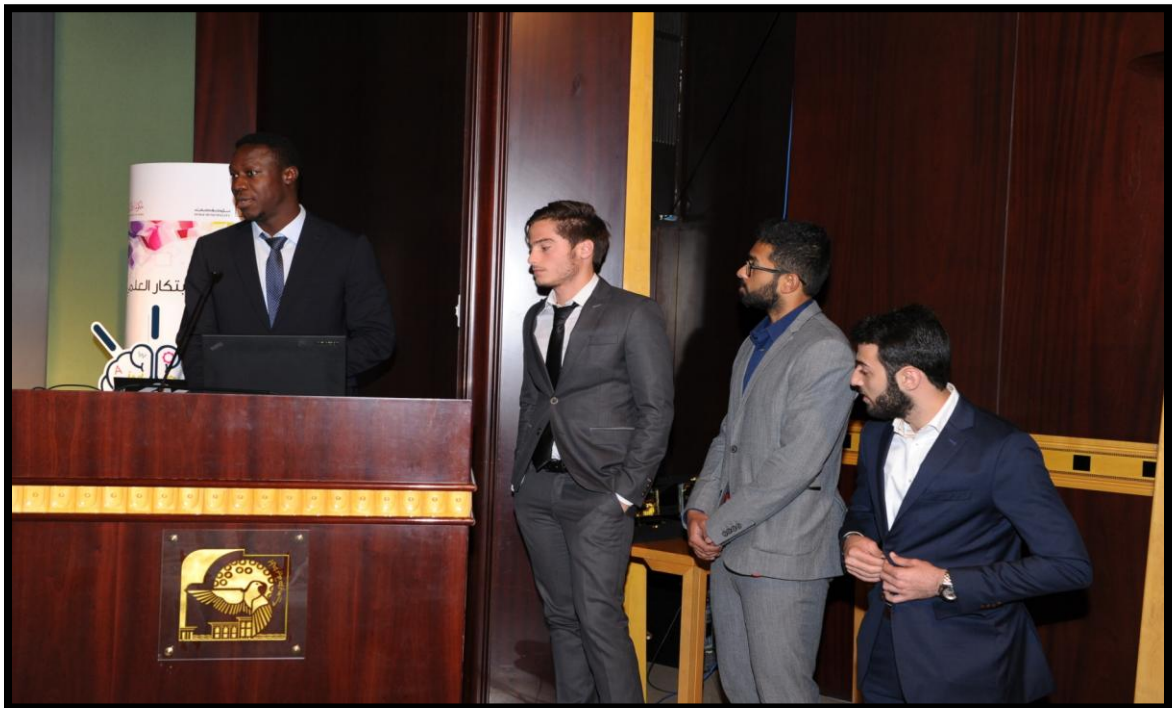
Figure (10): The presented paper by American University in Dubai (27/04/2016)