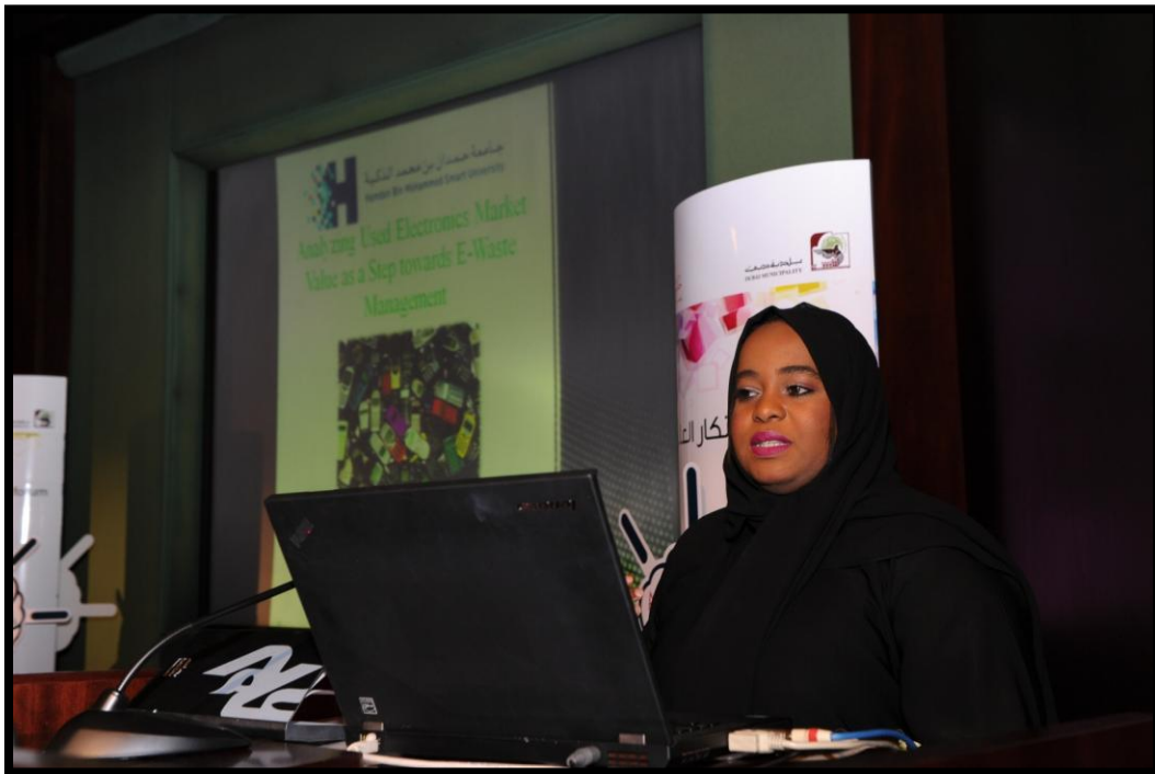
Figure (8): The presented paper by Hamdan Bin Mohammed Smart University (27/04/2016)