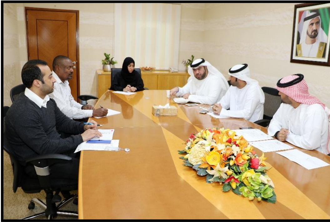
Figure (1): The first coordination meeting to discuss the first stage of the initiative (02/02/2016)