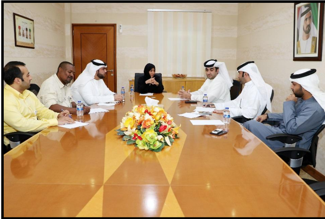
Figure (2): The second coordination meeting with the Knowledge and Innovation Depart. (08/02/2016)