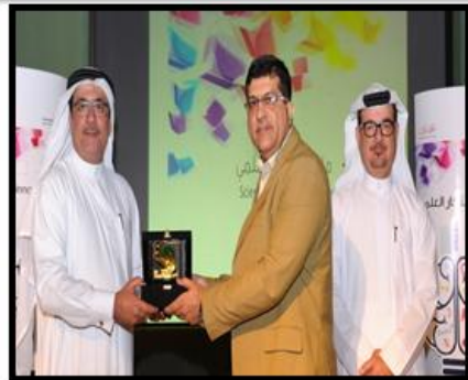
Figure (13): Honoring universities by Dubai Municipality (27/04/2016)