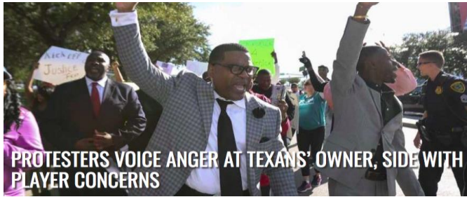
PROTESTERS VOICE ANGER AT TEXANS' OWNER, SIDE WITH PLAYER CONCERNS