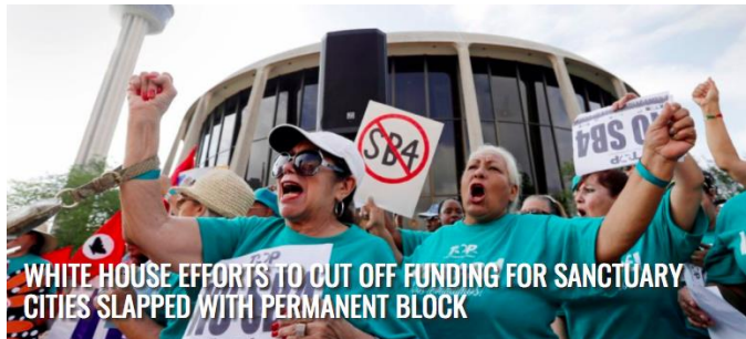
WHITE HOUSE EFFORTS TO CUT OFF FUNDING FOR SANCTUARY CITIES SLAPPED WITH PERMANENT BLOCK