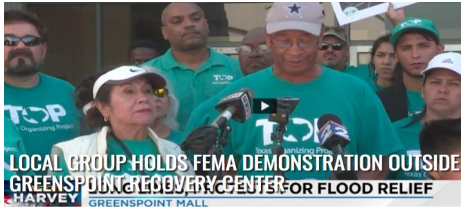
LOCAL GROUP HOLDS FEMA DEMONSTRATION OUTSIDE GREENSPPOINT RECOVERY CENTER HARVEY GREENSPPOINT MALL