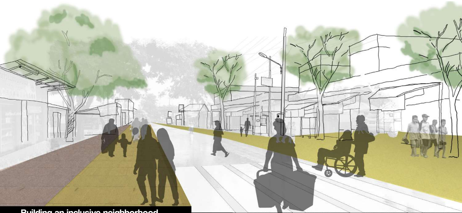
Building an inclusive neighborhood